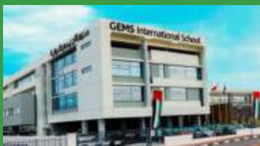
SCHOOL / UNIVERSITY